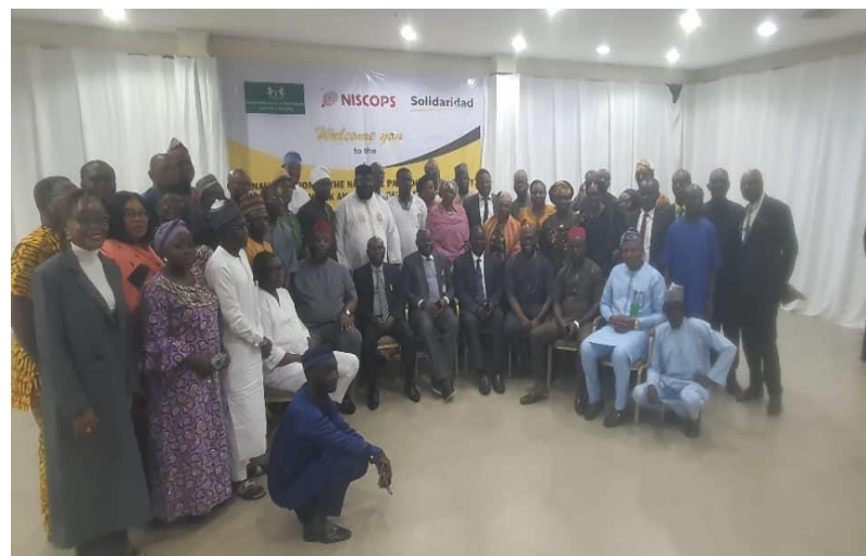
Pic 5 & 6: Group photograph of the Interagency Committee Members for the Inauguration.